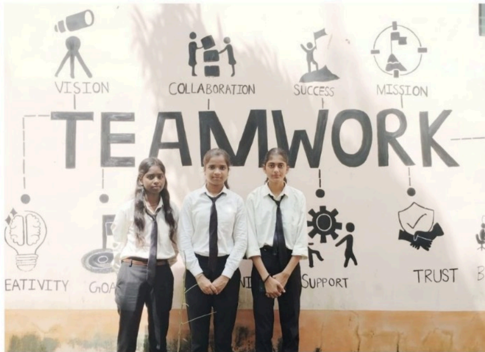
Students of 1st year(2024-2027) batch shows their creativity through wall art.